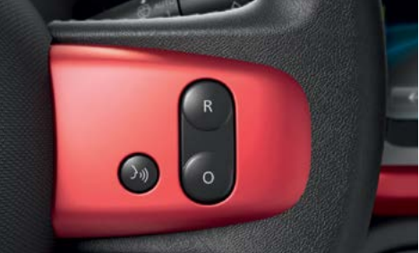
Voice control* Set your destination, call a contact or launch an application with voice control.