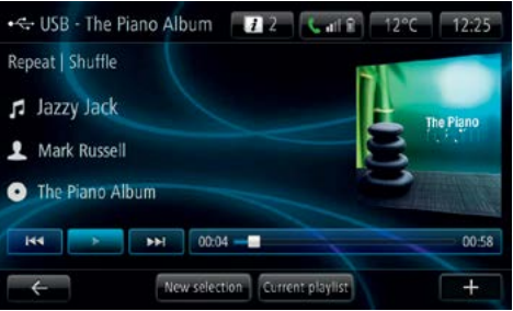
Multimedia* FM/AM/DAB tuner, connect devices via USB and AUX sockets or Bluetooth®.