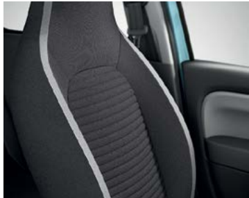
Java Grey upholstery