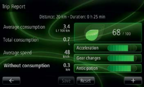
Vehicle information The fun "Eco Driving" coach gives you handy tips to improve your driving style and reduce your fuel consumption.