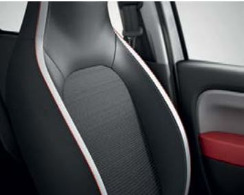
Sport part leather upholstery