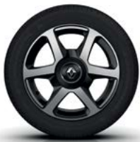
15" Ariane alloys