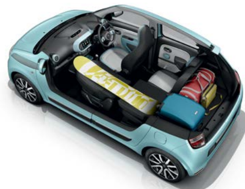
Enough space for a flat-pack bookcase