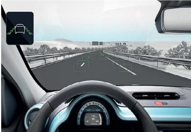
Optional lane departure warning Drive relaxed: if you cross a continuous or broken line without indicating, you get a visual and audible warning. (option)