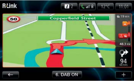
Touchscreen navigation system Provided by TomTom® (12 months subscription to LIVE services from delivery).