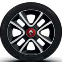
16" Sport alloys