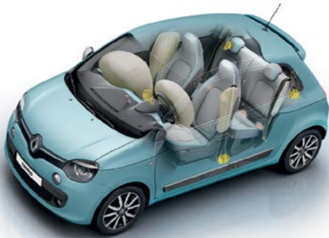
Protection Drive calmly. My architecture has been specially designed to absorb shocks;my front and side airbags protect you and your passengers.

In active and passive safety, Renault's expertise has nothing left to prove. The care taken to make our cities and our roads safer regularly receives rewards.