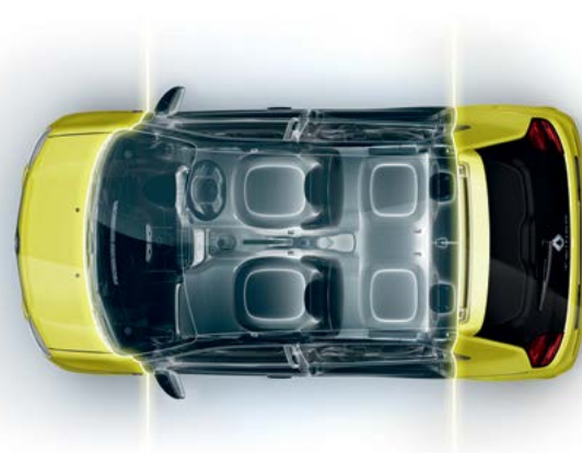
Split folding rear seats