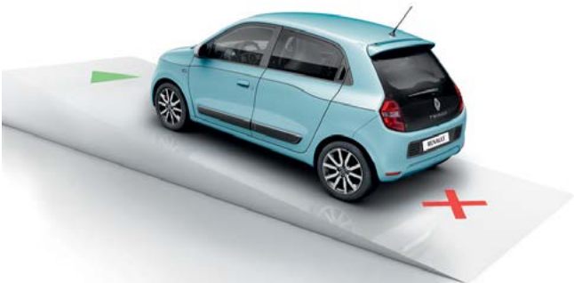
Hill Start Assist (HSA) Relax, I maintain the braking pressure automatically for 2 seconds... enough time for you to manoeuvre calmly.