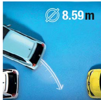
Impressive turning circle