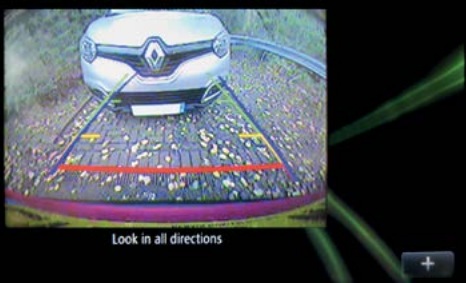
Reverse parking camera system Rear parking sensors with reverse parking camera, which displays the image on the navigation system screen alongside guidance aids.