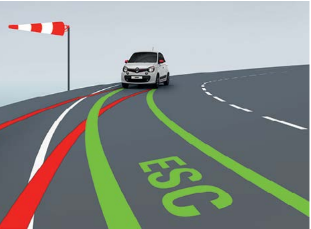
Electronic Stability Control (ESC) Difficult road conditions? Along with the anti-slip regulation (ASR), the ESC monitors your trajectory.