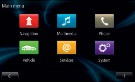
Main menu with 6 icons Discover the six available menus: navigation, multimedia, telephone, vehicle information, services and applications, system settings.

R-Link is available with the Techno Pack which also includes a reverse parking camera.